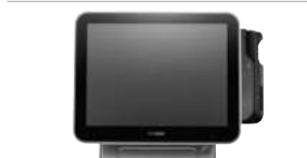
Multi-reader (MSR, SCR)