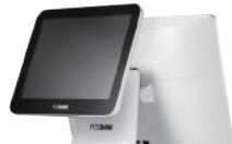
2nd Display • 9.7", 12.1", 15" LCD