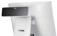
Customer Display • VFD (2 Lines x 20 Characters)