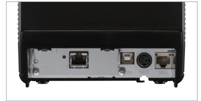
• Interface. Ethernet