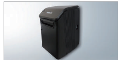
• Wall-mount Deployment