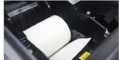
• 2" Paper Roll with Partition